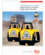
Rugby 300SG/400DG Single and dual grade construction lasers