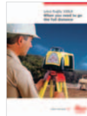
Leica Rugby 100LR The long range construction laser