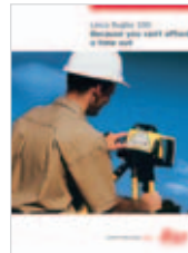
Leica Rugby 100 The tough construction laser