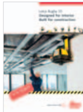
Leica Rugby 55 The multipurpose construction laser

R50 (Art. No.:753672): Laser class 1 in accordance with IEC 60825-1 and EN 60825-1